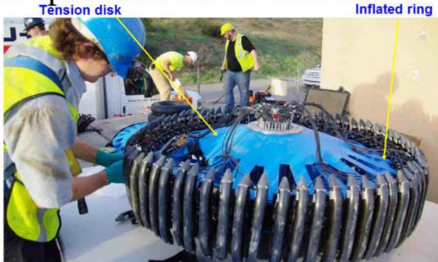
Workers from the San Diego County Water Authority install an electromagnetic assessment tool in a pipeline in Lakeside

jpw only makes the inflated parts of this product